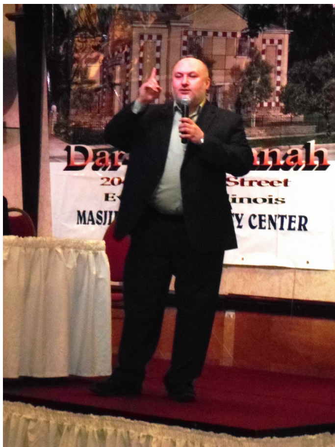
duced the key note speaker and fundraiser of the event – Sheikh